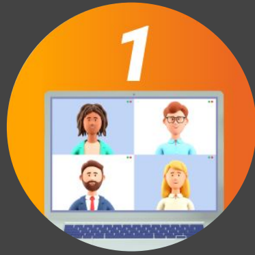
Video Interview Screening