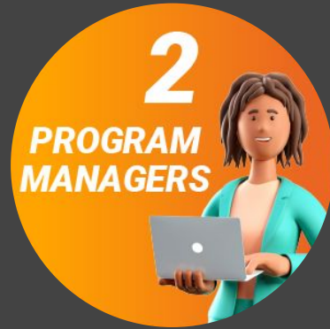
Interview with Program Managers