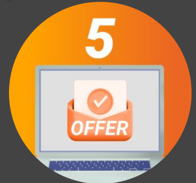
Letter of Offer