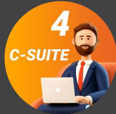
Interview with C-Suite