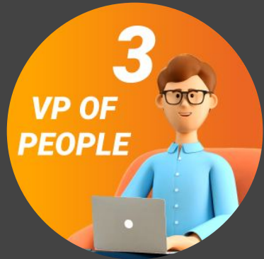
Interview with VP of People